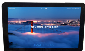
Model 10" Touch Screen