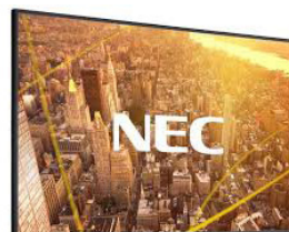
NEC LCD Screen