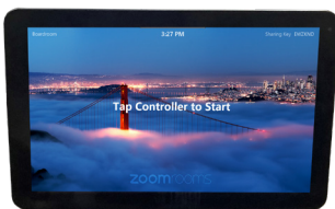
Nodel 10" Touch Screen