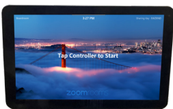
Lumicom 10" Touch Screen