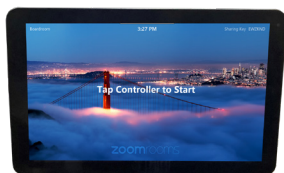
Nodel 10" Touch Screen