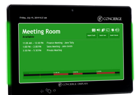
Concierge Displays Panel (optional)

Also includes Lumicom Zoom Room Nuc, optional Wired HDMI input.