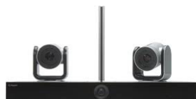
Polycom EagleEye Director