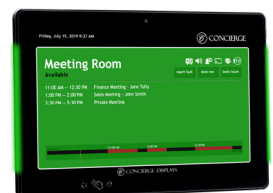
Concierge Displays Panel (optional)

Also includes Lumicom Zoom Room Nuc, optional Wired HDMI input.