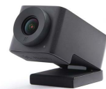
Huddly IQ Camera

Also includes Lumicom Zoom Room Nuc, optional Wired HDMI input.