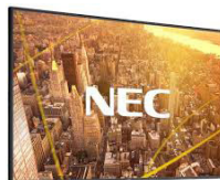
NEC LCD Screen