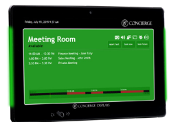
Concierge Displays (optional)

Also includes Lumicom Zoom Room Nuc, optional Wired HDMI input.