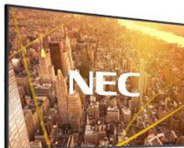
NEC LCD Screen